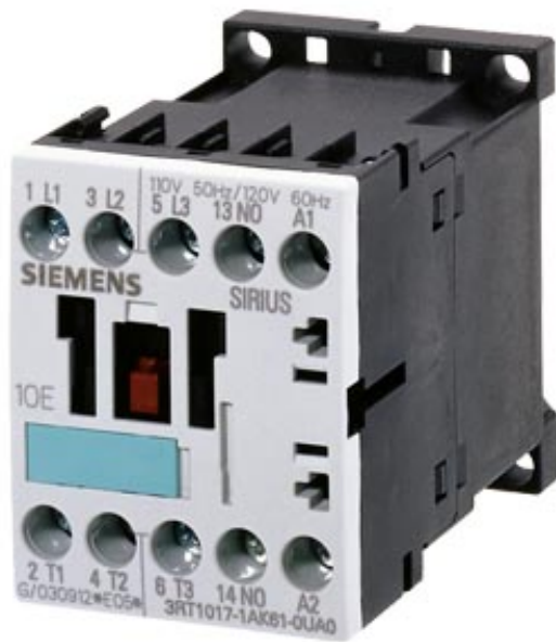
CONTACTOR, AC-3 4 KW/400 V, 1 NC, AC 24 V, 50/60 HZ, 3-POLE, SIZE S00, SCREW CONNECTION