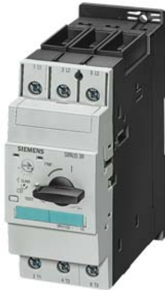
CIRCUIT-BREAKER 14...20 A, N-RELEASE 260 A, SIZE S2, MOTOR PROTECTION CLASS 10 SCREW CONNECTION STANDARD BREAKING CAPACITY