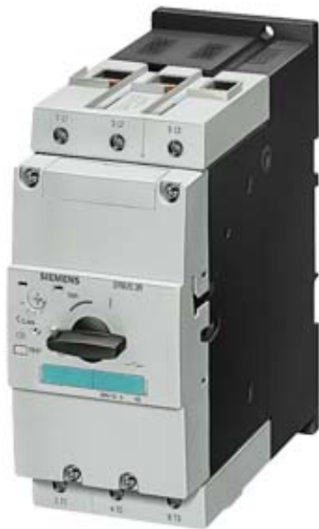
CIRCUIT-BREAKER SIZE S3, FOR MOTOR PROTECTION, CLASS 10, A-REL. 80...100A,N-REL. 1235A SCREW TERMINAL, STANDARD SWITCHING CAPACITY